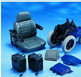
Disassembled for transport.